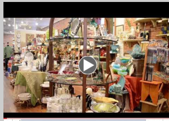
Apalachicola Bay Chamber of Commerce & Visitor Centers Commercial

Click to view the Apalachicola Bay Chamber of Commerce & Visitor Centers Commercial