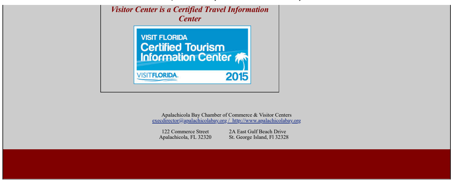
Copyright © 20XX. All Rights Reserved.

Apalachicola Bay Chamber, 122 Commerce Street, Apalachicola, FL 32320