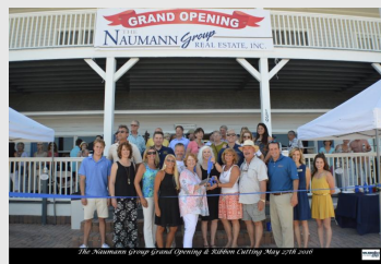
The Naumann Group May 27th, 2016