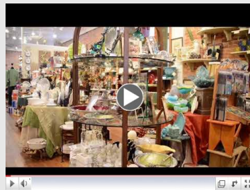
Apalachicola Bay Chamber of Commerce & Visitor Centers Commercial

Click to view the new Apalachicola Bay Chamber of Commerce & Visitor Centers Commercial