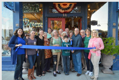
Apalach Olive Oil Company