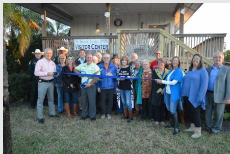
Apalachicola Bay Chamber of Commerce St. George Island Visitor Center